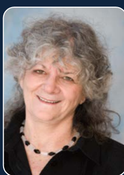
Ada Yonath Nobel Laureate in Chemistry 2009, Weizmann Institute of Science, Israel