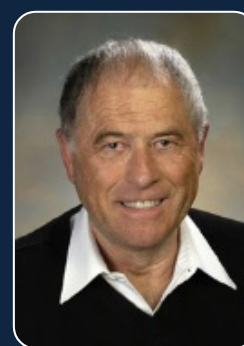
Kurt Wuthrich Nobel Laureate in Chemistry 2002, ETH Zurich, Switzerland/ The Scripps Research Institute, USA